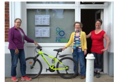
Solent Remade in Havant – just one example of repurposing redundant spaces.