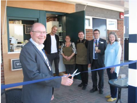
The launch of a new coffee shop at Honiton Station.

Photographs are an excellent way to show off all of the great work going on in the world of Community Rail. We have had lots of photos sent in from CRP's and Station Adopters showcasing your achievements and hard work put into enhancing stations – keep them coming, even better if you post on social media and tag us!