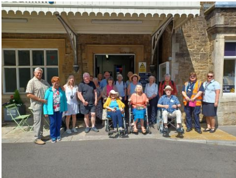
Dementia friendly Try the Train trip.