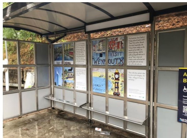
New artwork in the waiting shelter at Winnersh.