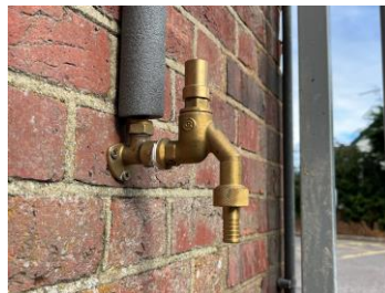
Lots of taps are appearing across the network!