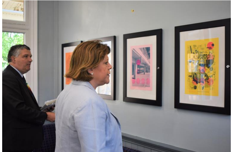
Maria Miller MP viewing student artwork at Basingstoke Station.