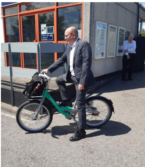
The launch of Beryl Bikes at Wool Station, promoting the use of sustainable travel.